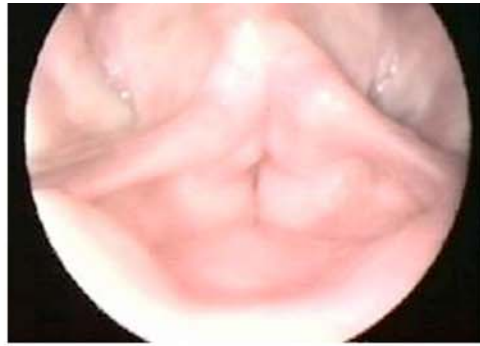
Figure 14. A cardinal glottal stop state of the glottis (Esling and Harris 2002).