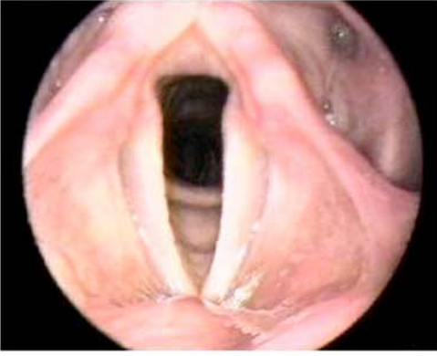
Figure 2: A cardinal breath (voiceless) state of the glottis (Esling and Harris 2002).