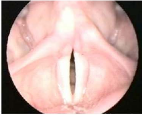
Figure 1: A cardinal prephonation state of the glottis (Esling and Harris 2002).